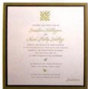
31% | Beaulieu letterpress invitation, $1,140 for 150 (includes envelopes), by Dauphine Press; dauphinepress.com.