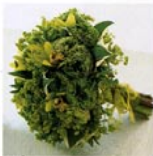
22% | Viburnum, ranunculus, lady's mantle, and green cymbidium orchids.

"I'd like something colorful and vibrant, with exotic flowers like orchids," says Victoria. "And no roses, please!"