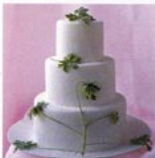
32% | Sugar-dusted white fondant accented with crystallized sugar leaves and stems.

Within the "natural" parameters, Victoria and Zach can go graphic and modern, or keep it simple with plain white tiers accented with green botanical details.