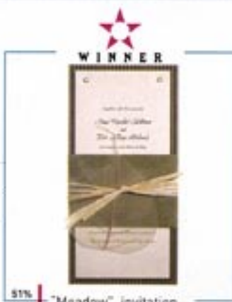
51% | "Meadow" invitation, $1,144 for 150 (includes envelopes), by PaperLove Invitations; paperloveinvitations.com.

She'd love letterpress invites that are "earthy and natural," in her brown-and-green color scheme. This is a sophisticated approach.