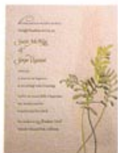
18% | Custom letterpress invitation, $1,850 for 150 (includes envelopes), by Twig & Fig; twigandfig.com.