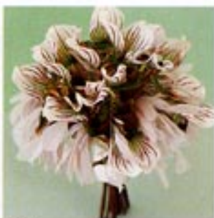
33% | Maroon-striped lady's slipper orchids accented with white feathers.