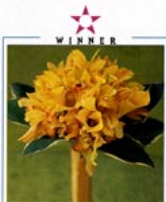
45% | Yellow cymbidium orchids and calla lilies in a collar of hosta leaves.