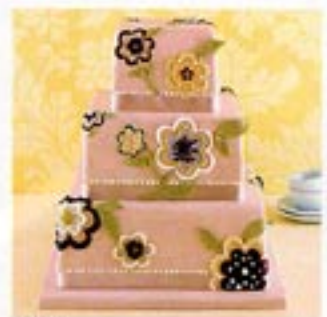
26% | Mocha-colored fondant accented with multicolored stenciled or applied fondant blossoms.