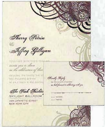
ELEGANT SCROLLWORK A design is letterpressed on soft cotton paper. East Six