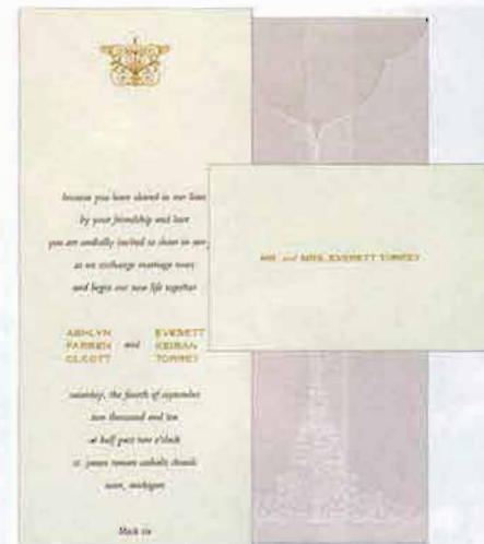
SKINNY SHAPE A tea-length card modernizes a traditional design. Vera Wang