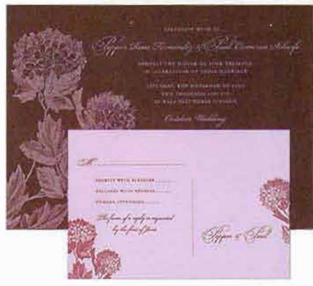
FLORAL SILHOUETTE Delicate flowers soften the look of a deep hue. Dauphine Press