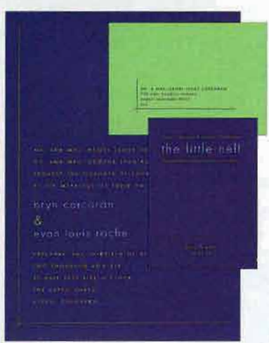
BOLD COLOR COMBO Navy blue and kelly green team up for a formal look. Mia Carta